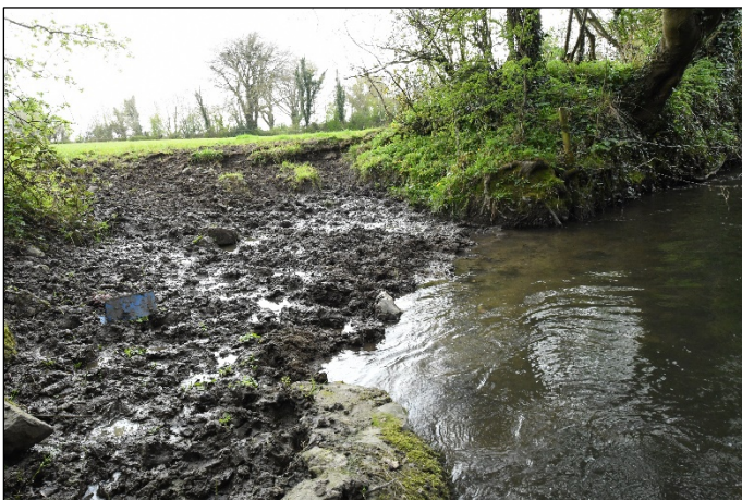
Plate 3 Cattle access downstream of Brooke Bridge.