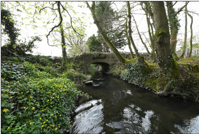
Plate 1 Brooke Bridge viewed from upstream.