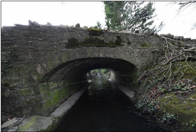
Plate 2 Brooke Bridge viewed from upstream.