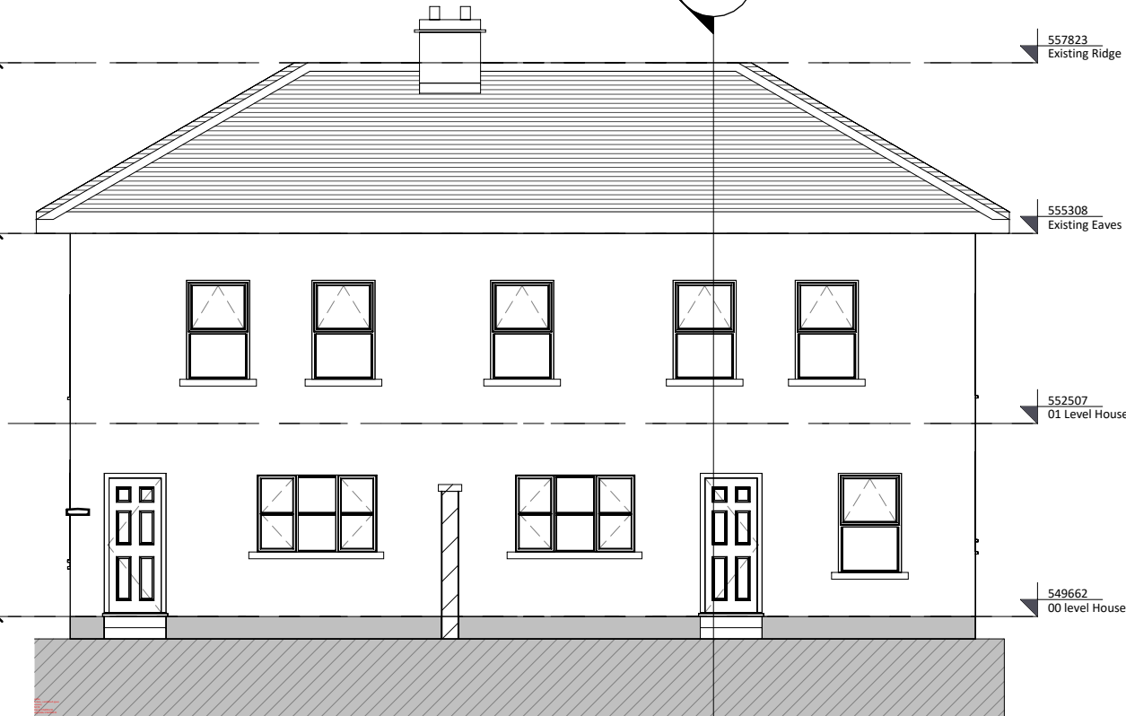
1 Existing rear Garda Elevation-North 1 : 100