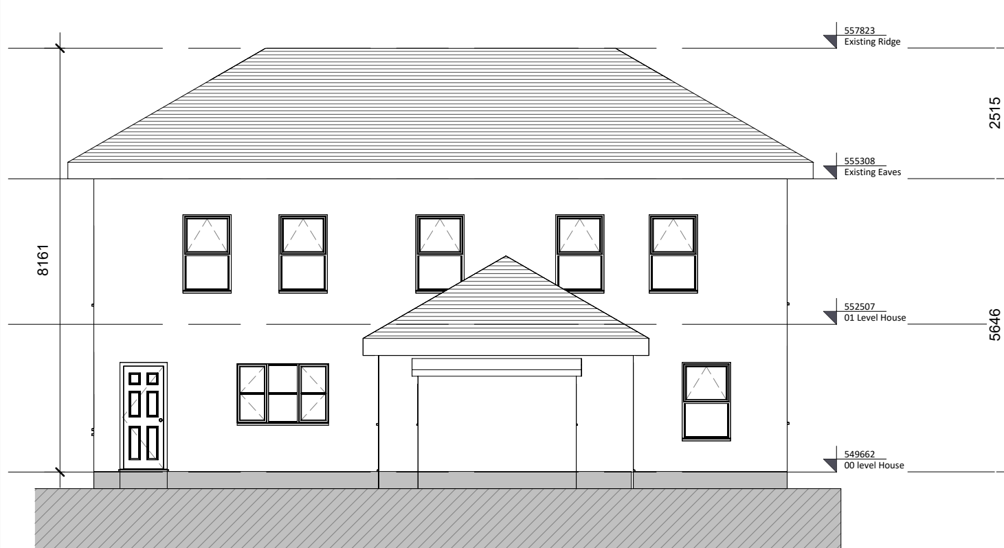
4 Existing Elevation shed 1 : 100