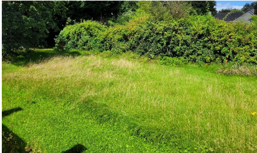
Plate 3 Looking north west to rear gardens of cottages.