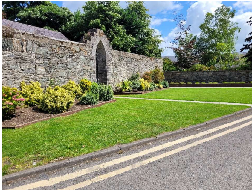
Plate 1 Looking east at RPS no. NS19-205, NIAH no. 11814115, the Catholic Church of Our Lady and Saint David.