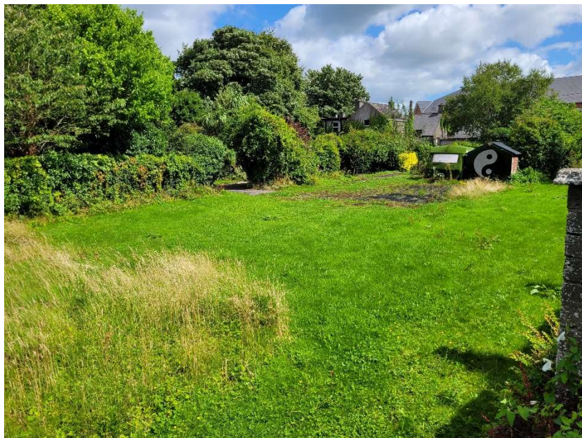
Plate 4 Looking east at rear gardens of cottages.