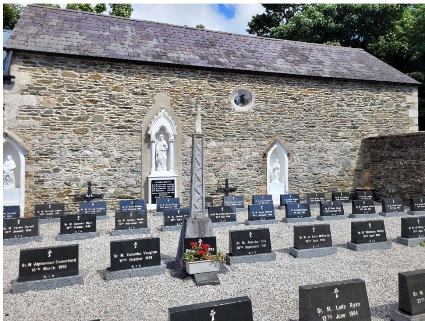
Plate 2 Looking north at RPS no. NS19-205, NIAH no. 11814115, the Catholic Church of Our Lady and Saint David and associated graveyard.