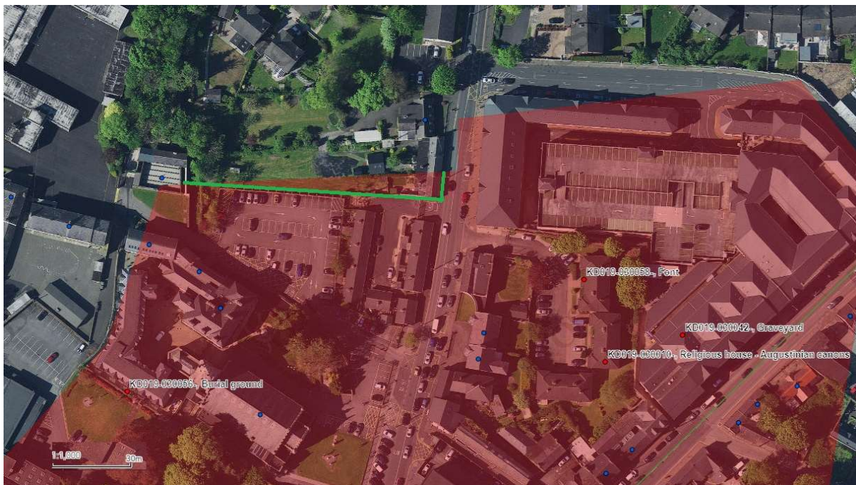
Figure 4 Showing nearby recorded monuments (green line indicates part of PDA which intersects the ZAP for KD19- 030--, Historic Town.