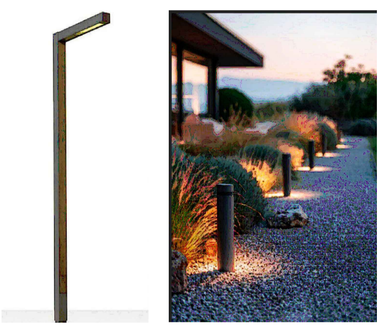
5M HIGH POLE MOUNTED LED LIGHT FITTING (TYPE A) 1M HIGH BOLLARD LED LIGHT FITTING (TYPE B)