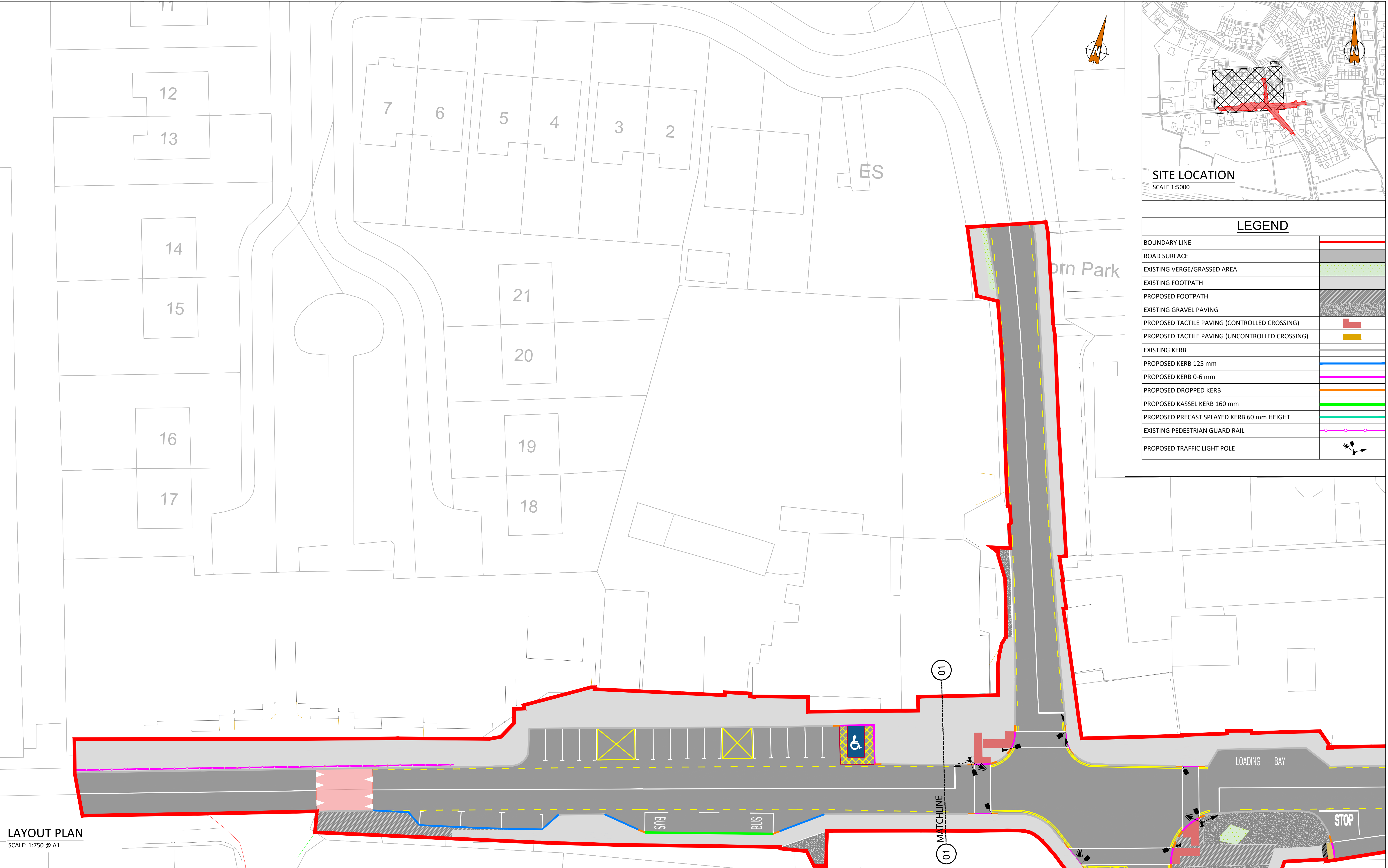
LAYOUT PLAN SCALE: 1:750 @ A1