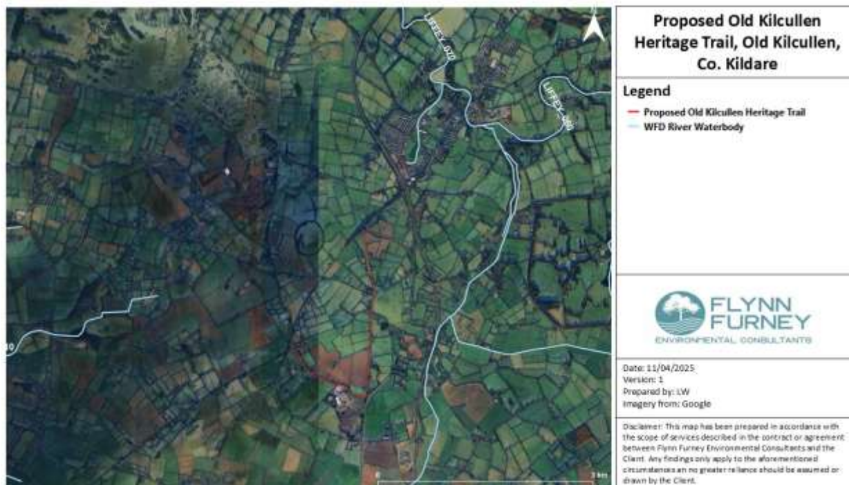
Figure 2: Surface water features surrounding the site of the proposed trail

09), specifically the Liffey_SC_040 (Subcatchment_ID: 90_11), and the Barrow WFD catchment (Catchment_ID: 14), specifically the Barrow_SC_060 (Subcatchment_ID: 14_18).