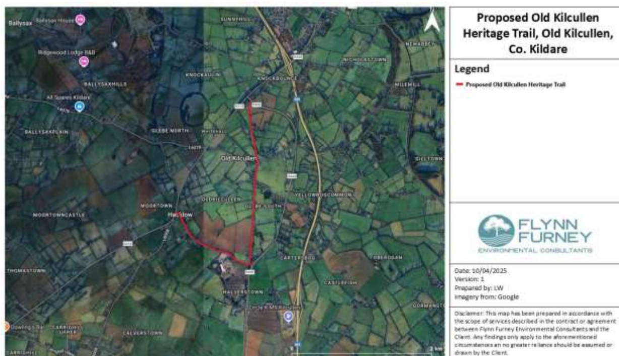
Figure 1: Location of proposed development

Flynn Furney Environmental Consultants have been appointed to provide the information necessary to allow the competent authority to conduct an Article 6(3) Screening for Appropriate Assessment for the proposed Old Kilcullen Heritage Trail at Old Kilcullen, Co. Kildare. A full description of the proposed works is given in Section 2 below.