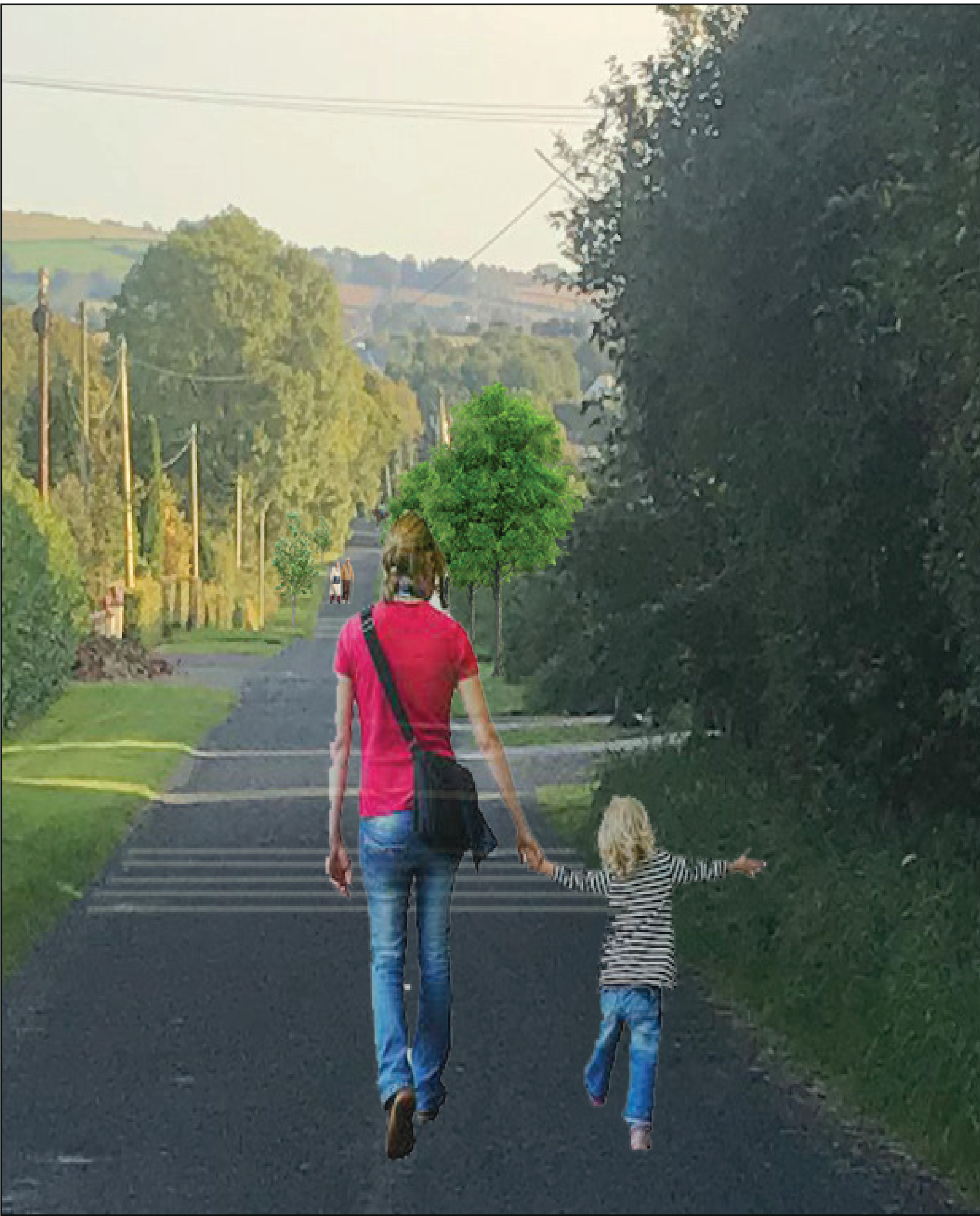
VP4 A closer look, viewing towards Halverstown Cross. The False Cattle Grids do not appear incongruous in this landscape setting taking all the landscape elements into consideration..