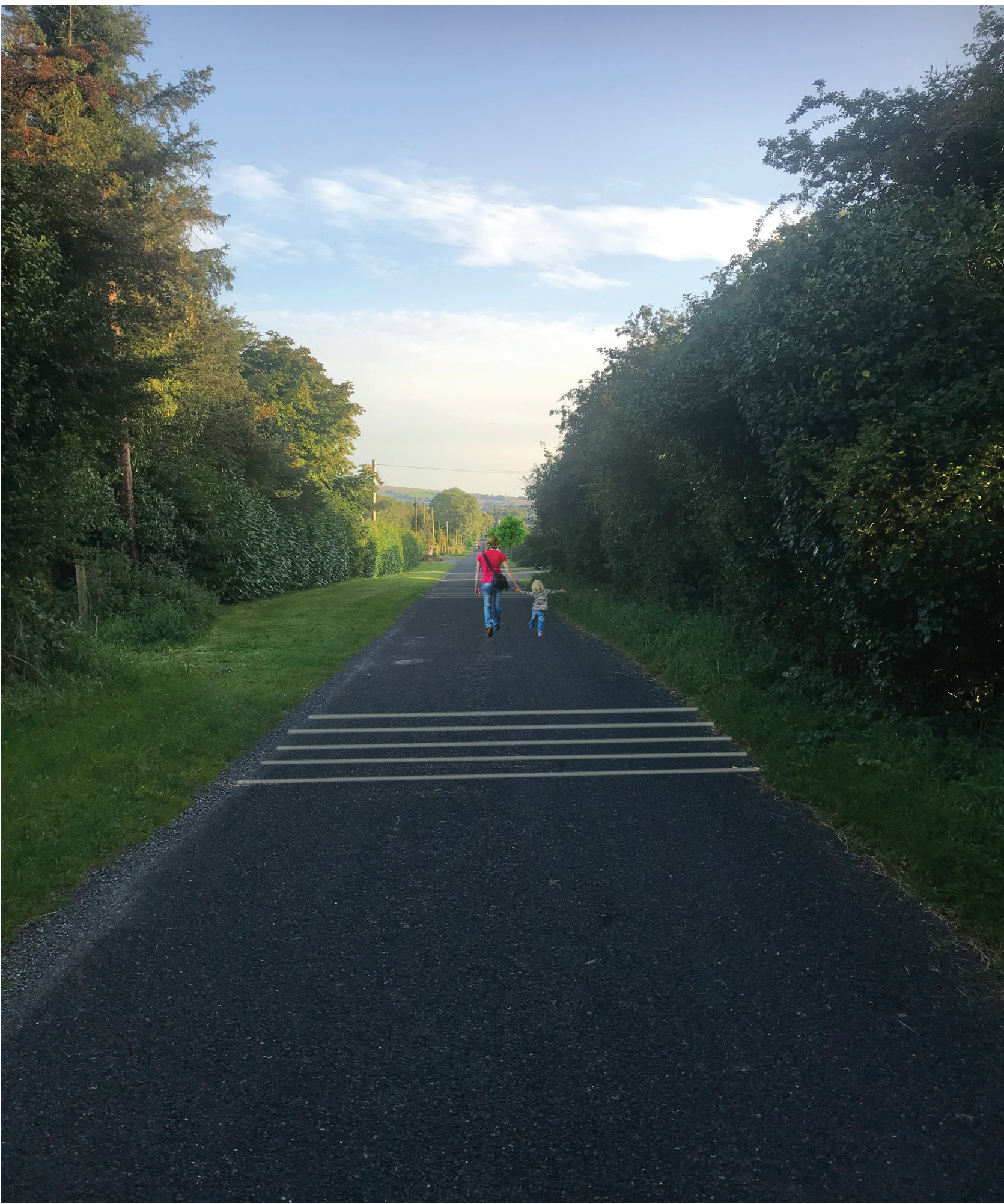
VP3 Looking towards Halverstown Cross. The False Cattle Grids do not appear incongruous in this landscape setting.